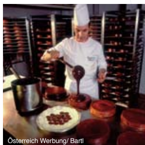
Österreich Werbung/ Bartl