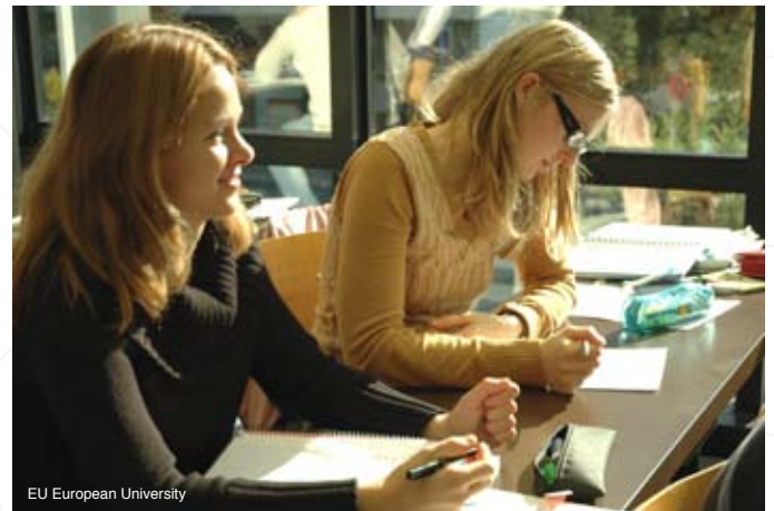
EU European University